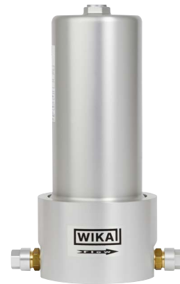
Portable SF 6 filter unit, model GPF-10