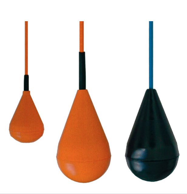
Fig. left: Model SLS-M2 Fig. centre: Model SLS-MS1 Fig. right: Model SLS-MS1-Ex