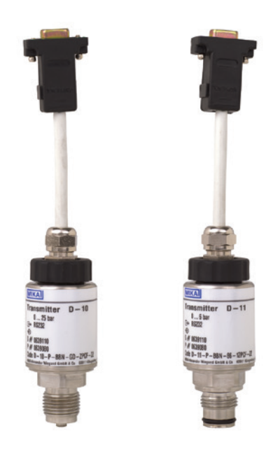
Fig. left: Pressure sensor model D-10

Fig. right: Pressure sensor model D-11, flush